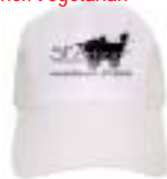
SPArties Cap - $20

Monavie Health & Wellness Program - $4/day Contact us for bulk discounts This is NOT wine, nor does it contain alcohol or animal products. Kosher/Vegetarian