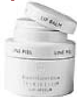
Lip Mask & Balm - $30