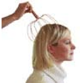
Scalp Massager - $30

Entire Spa ReTREATment set - $100 (Includes all 4 items)