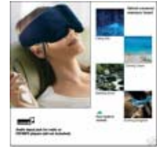
Soothing Sound Eye Shades - $40