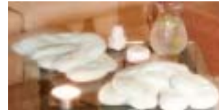
Aromatherapy Neck Wraps - $30