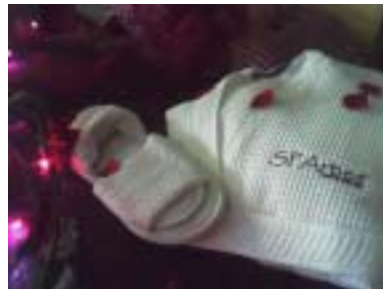
SPArties Robe & Slippers - $25