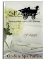
SPArties Magnet - $5